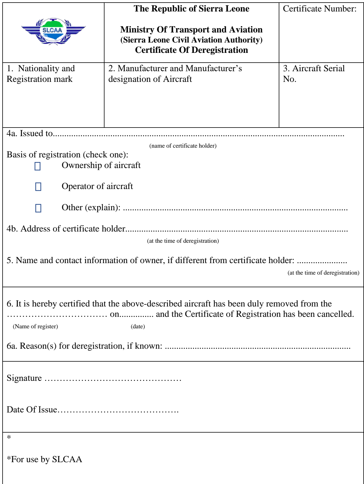
Figure 2. Certificate of Deregistration