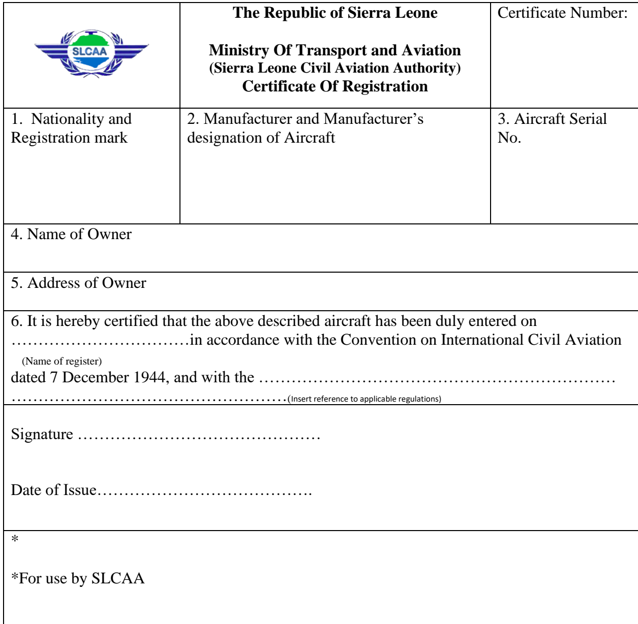
Figure 1: Certificate of Registration